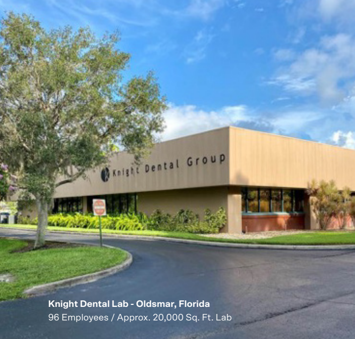
Knight Dental Lab - Oldsmar, Florida 96 Employees / Approx. 20,000 Sq. Ft. Lab